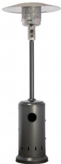
CZGB-A1 (Without table)