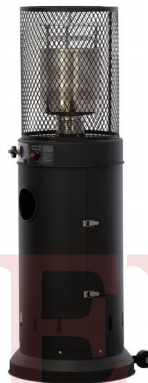
CZGB-HN-6 / CZGB-HN-9