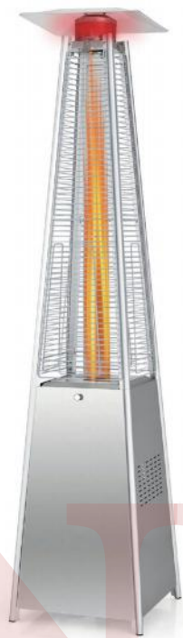
CZGB-I (Stainless Steel)