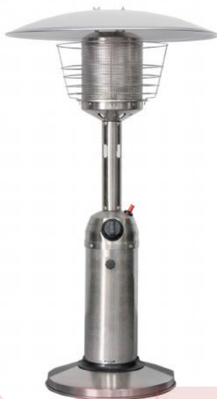
CZGB-J2 (With tank)