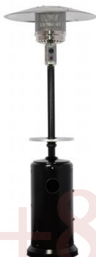
CZGB-A1 (With table)