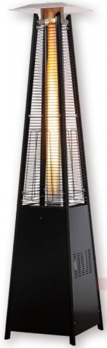
CZGB-I (Steel Powder)