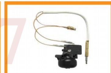
Anti-Tilt Switch Device