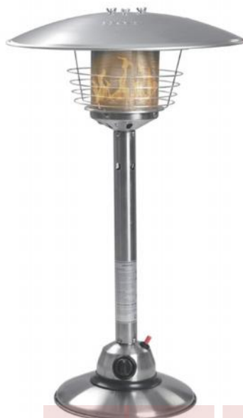
CZGB-J2 (Without tank)