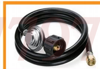
Regulator & Gas Hose