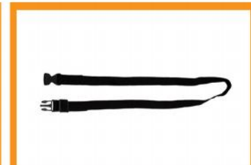
Gas Bottle Belt