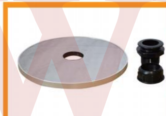
Table & Connector